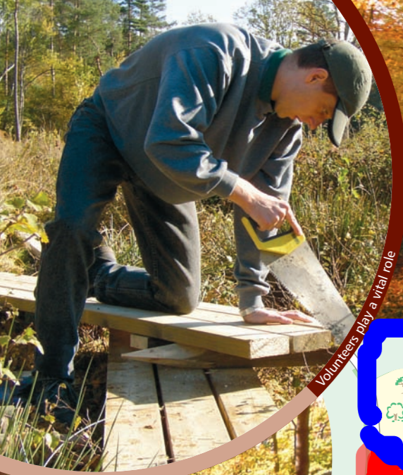
Volunteers play a vital role