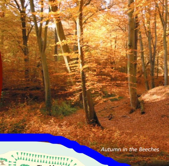
Autumn in the Beeches