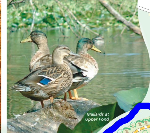
Mallards at Upper Pond