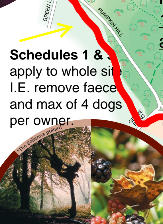
The Ballerina pollard