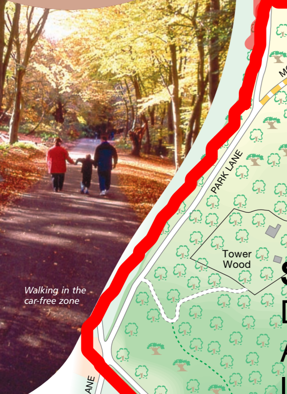
Walking in the car-free zone